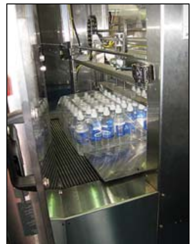
Wrapped bottles enter the shrink tunnel.