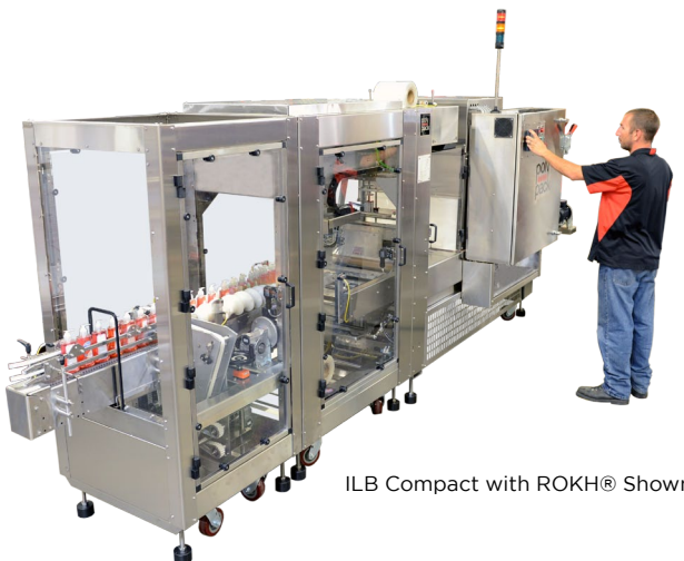
ILB Compact with ROKH® Shown

INLINE BUCKET SHRINK BUNDLER. Polypack's ILB series shrink bundlers are intermittent motion shrink bundlers that use a bucket conveyor to wrap a wide range of products. They are available in hand-loaded models, or with a fully automatic product collation modules designed specifically for your application. Any products that can fit onto the bucket can be wrapped in bullseye shrink. For unstable products such as ovals and tubes, Polypack offers a patented ROKH® pick & place gantry that automatically picks up the product and places it onto the bucket conveyor for wrapping. Combined with servo-driven technology, the ROKH® pick and place system can load products quickly and accurately, and the system can be fine-tuned to transfer products with unprecedented precision.